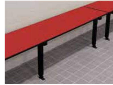
Solid grade laminate Single plank